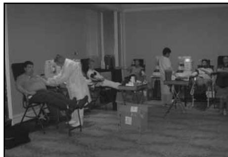
A record 56 Alyx units were collected on April 13th at Local 68 IUOE's annual blood drive at the Taj Mahal in Atlantic City.

"Donors like the Alyx because they often feel better after the donation since they are not losing any